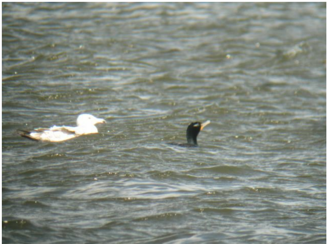
Dbl-cr. Cormorant (White-crested) 4-11-15.jpg