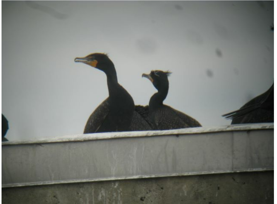
Dbl-cr. Cormorant (White-crested) #2 4-14-15.jpg